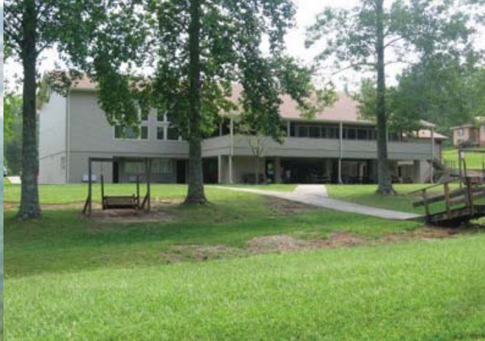
Table Rock Retreat & Conference Center 600 West Gate Road Pickens, SC 29671

The camp is located just off Hwy. 11, adjacent to Table Rock State Park.